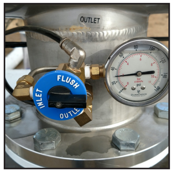
Selector pointed to "INLET"

The first thing to do is check the pressure at the filter inlet and the filter outlet to find out the pressure difference across the filter. This is done by pointing the arrow on the selector located next to the gauge first to INLET and then to OUTLET so that the pressure difference can be read with the same gauge so there is no worry about calibration between two gauges.