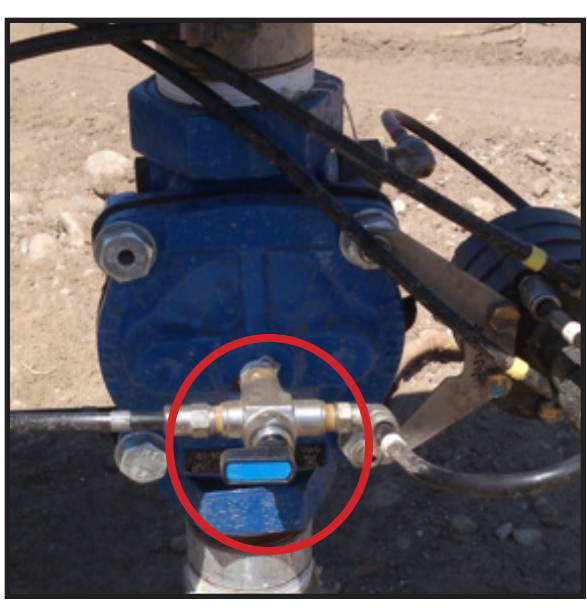
Flush valve in OPEN position

If the difference between the INLET and the OUTLET is more than 10 PSI, this means that the screen is dirty and there may be a problem with the filter or the controls. When this happens, the filter may be constantly flushing because the screen is dirty.