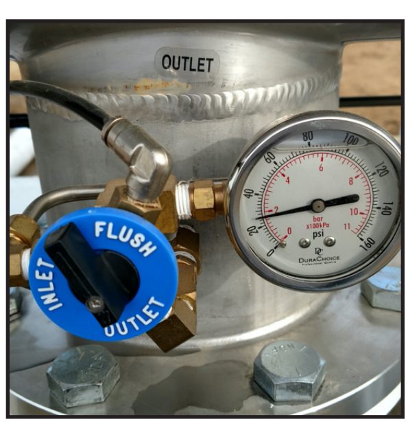
Selector pointed to "OUTLET"