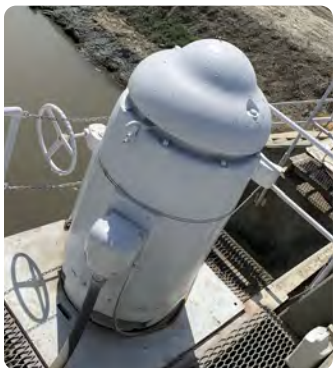
Canal Lift Pumps

The system trusted by California Ag operations. Hundreds of pumps and 100,000+ HP under management.